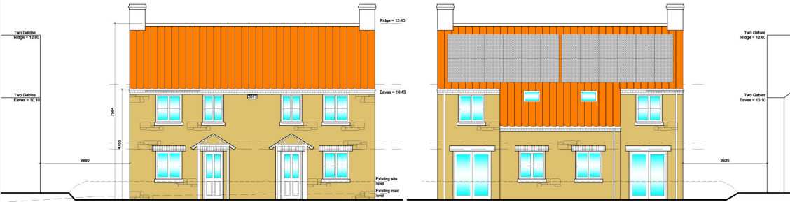
AS PROPOSED NORTH ELEVATION (Scale 1:50)

Notes Do not scale from this drawing or consider any dimension to be accurate. This drawing is based on drawings & information received from the client. In the event of any discrepancy being found, these should be brought to the attention of the Prospect Design for further instruction. This drawing is for Planning purposes only and is not to be considered a construction or setting out drawing. North Point shown approximately. The proposed layouts are subject to the following, although not exhaustive: 1. Structural Engineers Requirements. 2. Mechanical and Electrical Engineers Requirements. 3. Drainage Requirements. 4. Clearing approvals. 5. Building Regulations approvals.